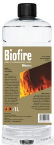
Bioethanol Fuel BIOFIRE Clean Burn Bioethanol Premium Grade Odourless 12 litre